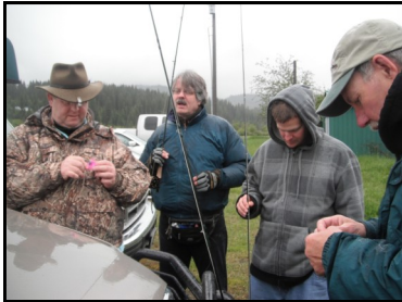
Elk River Instruction