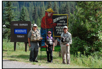
St. Joe Fishout